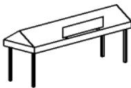
■ The A-Frame